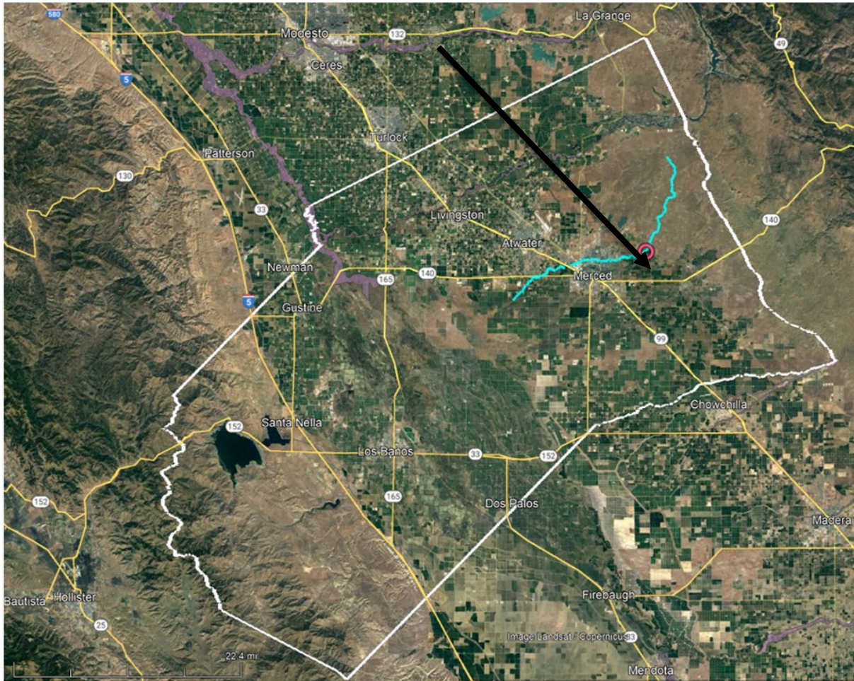
1) General vicinity map